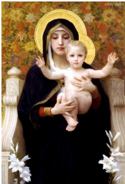
Image: "The Madonna of the Lilies" (1899) by William Adolphe Bouguereau (1825–1905).

Mother's Day has been celebrated in Australia on the second Sunday of May since 1924. But, Catholics have been celebrating a sort of mother's day since the first few centuries of the Church. The fourth Sunday of Lent, or Laetare Sunday, traditionally was a time to return to your mother church (home parish) and leave an offering. Those who practised this custom were said to have gone "a-mothering", and soon it became known as "Mothering Sunday." As the popularity of "Mothering Sunday" grew, it became a day when domestic servants were given leave to be with their families. The day became one of the few times a year where a grown family could gather, as working families often had conflicting schedules. Once the tradition became a day for family reunion, with a reference to mothers in the name, it naturally evolved to include all mothers within the celebration. For children, the long walk back home became a time for picking flowers for mum, and this would grow to the tradition of giving gifts of all sorts to mothers.