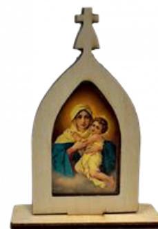
Shrine of the Pilgrim Mother