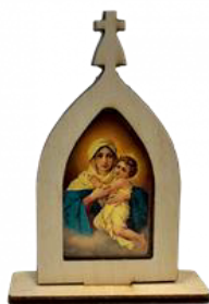
Shrine of the Pilgrim Mother