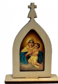
Shrine of the Pilgrim Mother